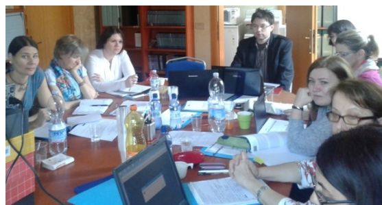
First partnership meeting in Carpi/IT

In order to make a valuable contribution to the enhancement of the labour market integration of elderly family carers the partnership of the ELMI project composed of organizations from Italy, Romania, Austria, Czech Republic and Poland will offer family carers the opportunity to strengthen their skills with an e-learning based course that will be transferred from Italy to Romania and give them not only useful information for their informal caring role but also a solid background to start from when looking for a job in the care field.